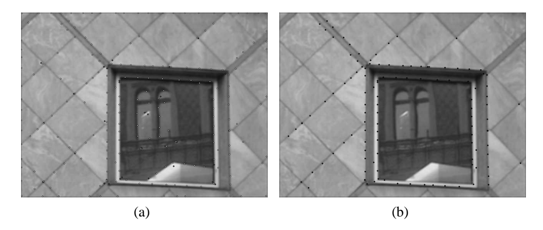
Fig. 3. (a) Interest points detected with combined Förstner and Harris operator; (b) final result after processing, application of interest operators and point filtering.

too (the grey-level differences in this area are the same as those of the "structure lines" of the facade). Undesirable points can only be suppressed by a suitable point filtering technique as described above. The resulting interest points are shown in Figure 3(b). Most of the undesirable points have been filtered by the rule-based filtering sequence; only a small number of points (inside the glass window) by user interaction.