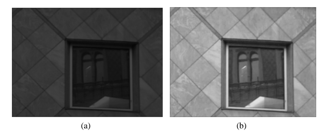
Fig. 2. (a) Noisy underexposed image; (b) image after image brightening and a 3 \times 3 median filtering

the user to adjust the interest points to a best qualification for all sorts of subsequent applications.