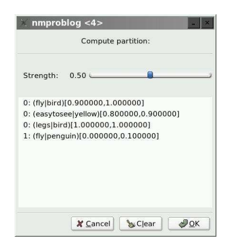
Figure 6: Window for computing the z_{\lambda} -partition.